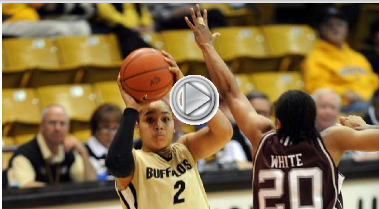
Smith sets a record with 254 career points.